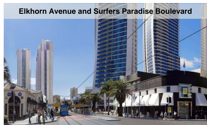
Elkhorn Avenue and Surfers Paradise Boulevard

Construction at the intersection of Elkhorn Avenue and Surfers Paradise Boulevard continues. Construction noise, dust and vibration will occur at times. Strict environmental controls are in place to minimise these impacts.