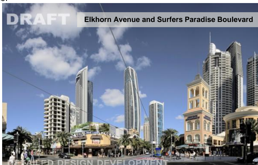
Elkhorn Avenue and Surfers Paradise Boulevard

Traffic on the highway between Australia Avenue and Victoria Avenue will be switched from the centre of the roadway to the outer lanes from Monday 10 September. No changes to the number of lanes or turning movements will take place. Access to Queensland Avenue will be restricted on the night of Sunday 9 September to undertake line marking.