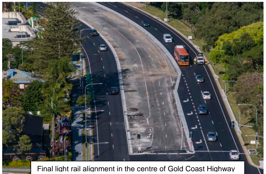
Final light rail alignment in the centre of Gold Coast Highway