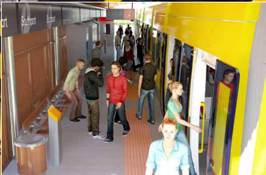
Artist's impression of the Southport Station.