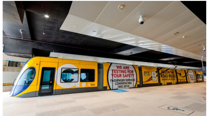
A tram at the Gold Coast University Hospital Station

To un-subscribe email STOP to goldcoastlightrail@macdow.com.au