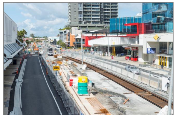
Track work in Scarborough Street

Access to all driveways along Scarborough Street between Queen and Nerang Streets will be left in/left out only with no right turn across Scarborough Street. This will be a permanent arrangement with traffic now on the final alignment.