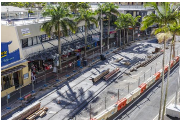
Track running down Surfers Paradise Boulevard

Surfers Paradise Boulevard is now one-way southbound from Cavill Avenue to Clifford Street.