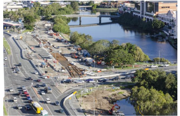
Broadbeach South Station construction area

The intersection will be reopened to traffic from 22 May 2013.