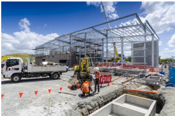
Steel structure at the depot site

Track laying, underground service work and construction of the building continue. Piling will work resume this week.