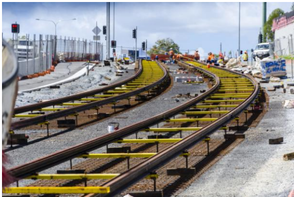
Track on parklands drive

Installation of storm water drainage will continue near Olsen Avenue. Track laying adjacent to Alumni Place and south of Engineering Drive will commence.