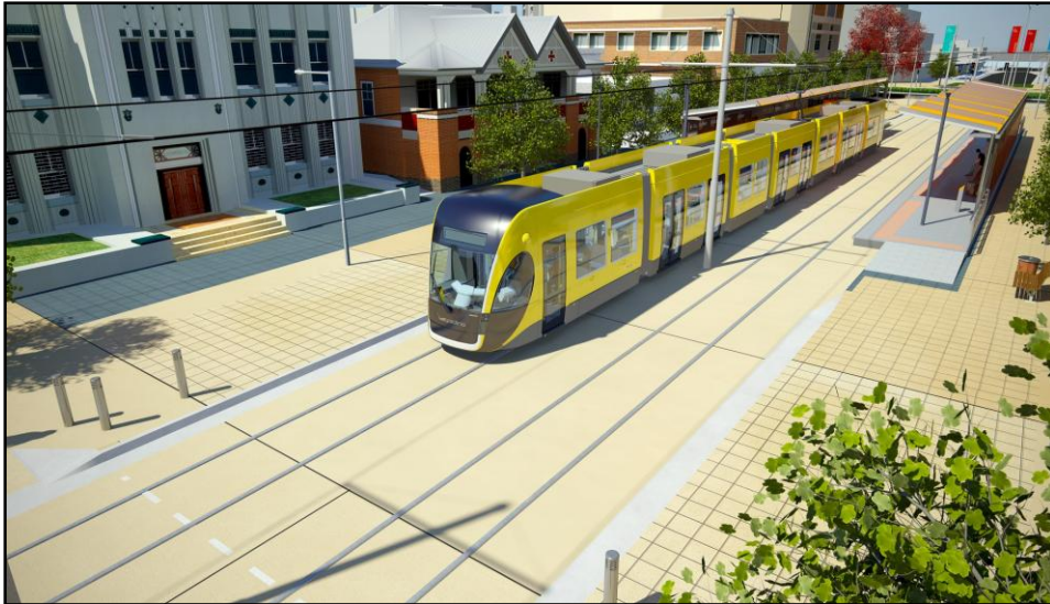
Artist's impression of Nerang Street between Davenport and Scarborough Streets when the light rail is completed.

Scan this barcode on your smartphone (download a free bar code scanner app) for more construction information.